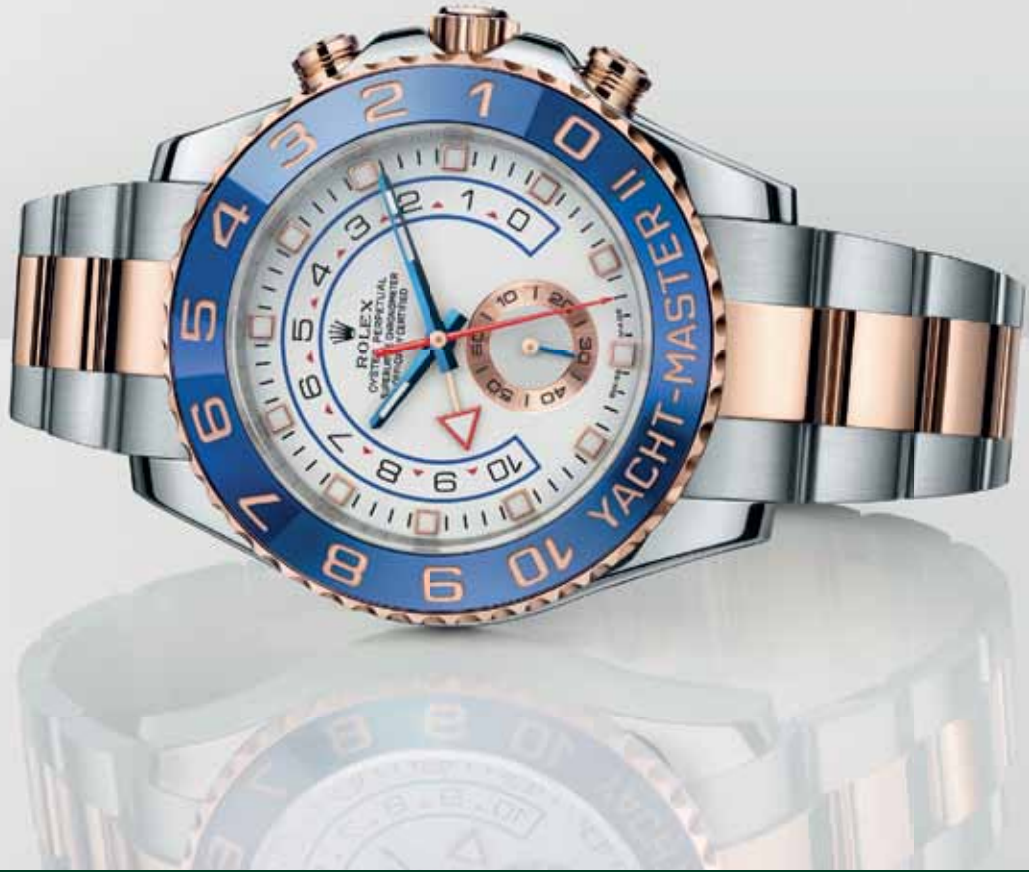
OYSTER PERPETUAL YACHT-MASTER II